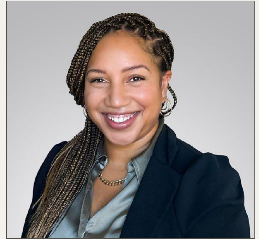
U.S. Navy Veteran Raven Class 62 Alumni

These men and women served our nation selflessly; now, it's our turn to honor their service and sacrifices.