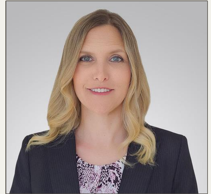
U.S. Marine Corps Spouse Alumni

Will you stand with us by hiring our Alumni, and supporting our mission?