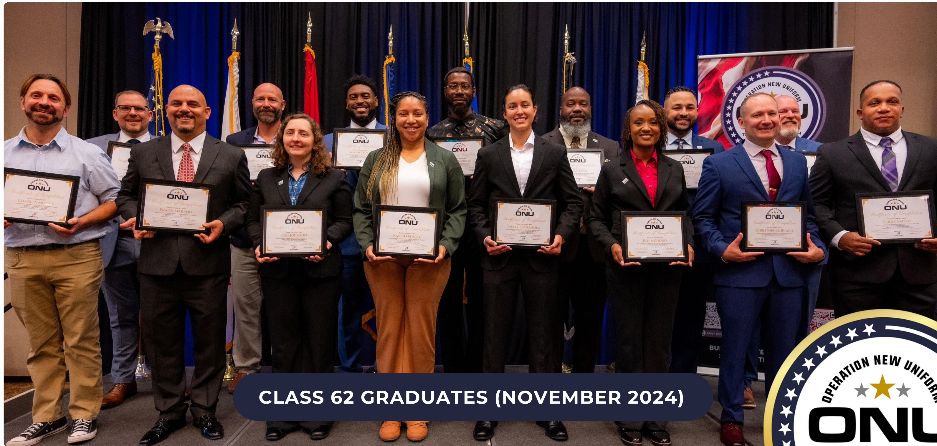
CLASS 62 GRADUATES (NOVEMBER 2024)